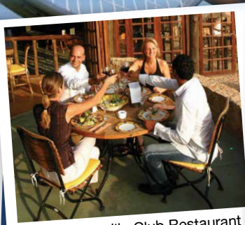
The Crocodile Club Restaurant